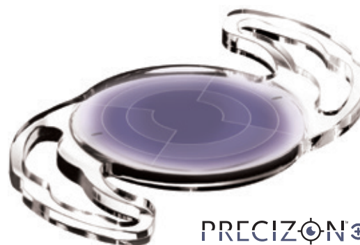
PRECIZON Aspheric Presbyopic Toric IOL