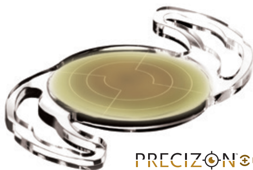
PRECIZON NVA Aspheric Presbyopic IOL