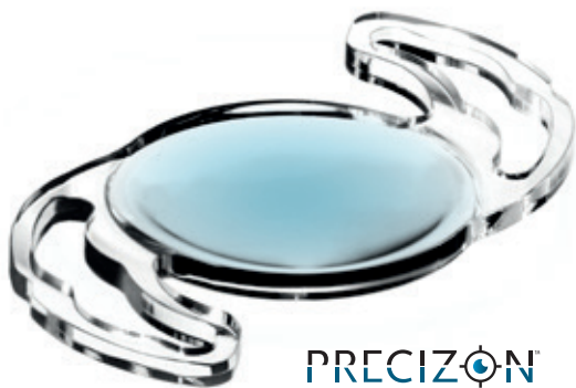
PRECIZON Aspheric Monofocal IOL