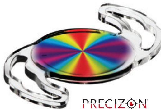
PRECIZON Aspheric Toric IOL